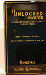
Best Enterprise Service Smart Digital Adoption is the key