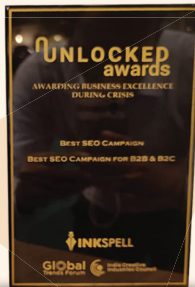
Best SEO Campaign Best SEO Campaign for B2B & B2C