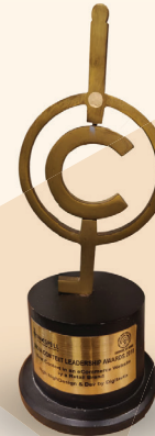
Best Ecommerce Portal Award Website Design & Develop (2018) for High High store