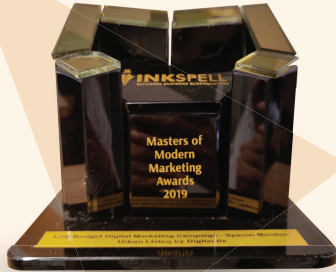
Master of Modern Marketing Award (2019) Low-Budget Digital Marketing Campaign for Urban Living Retail Store